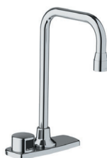
EBF-775 Deck Mount, battery ETF-770 Deck Mount, hardwired