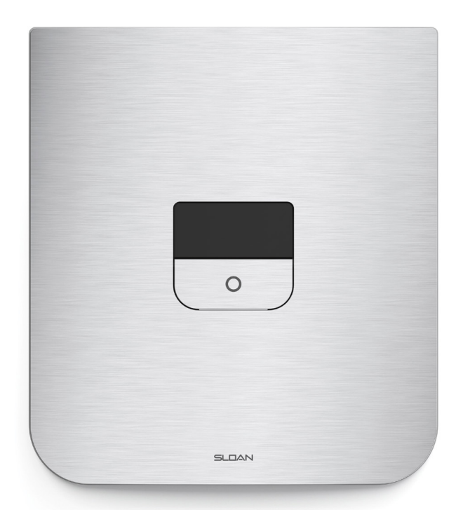
Brushed Stainless (PVDSF)