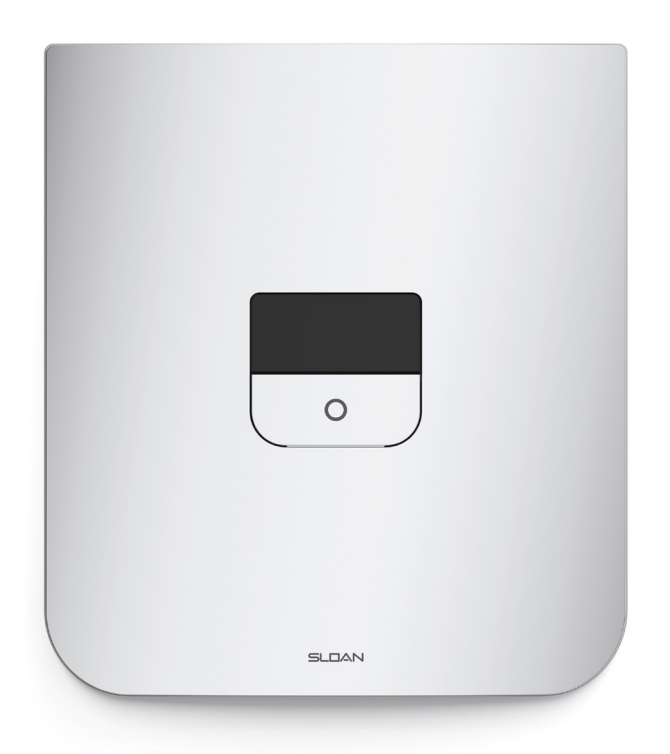
Sensor-Activated in Polished Chrome (CP)

We've worked closely with architects and designers around the world to ensure that our efficient, water-saving products are also beautiful. With a choice of Polished Chrome or 4 attractive PVD finishes, including our newest color, Graphite, the CX allows you to make the statement of your choice that elevates your restrooms.