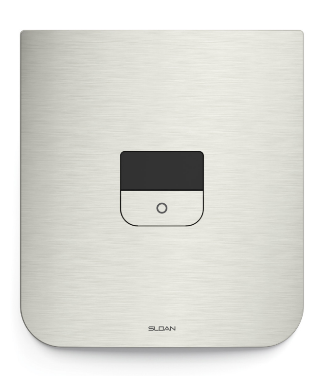
Brushed Nickel (PVDBN)