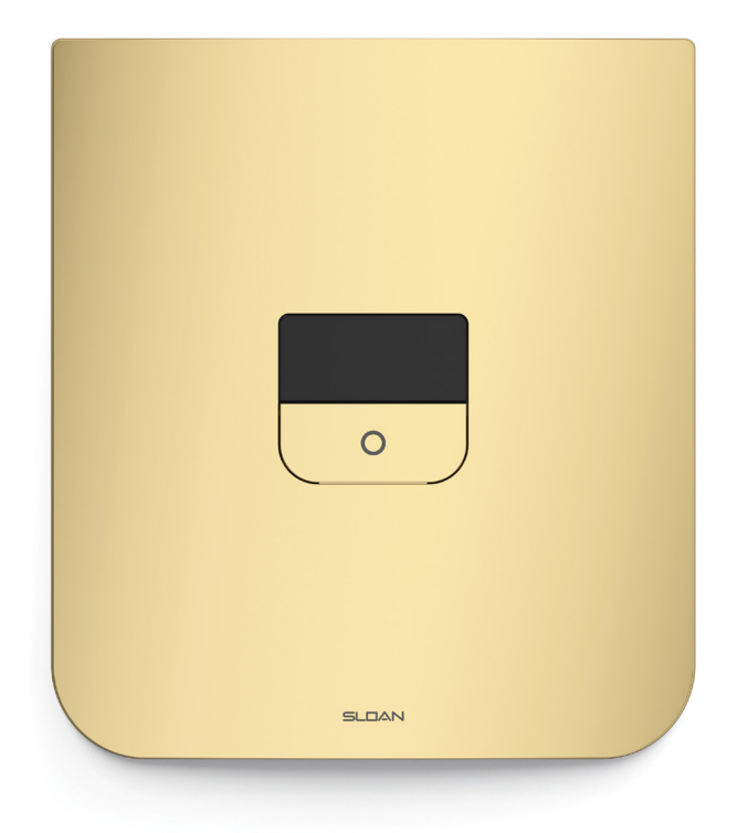
Polished Brass (PVDPB)