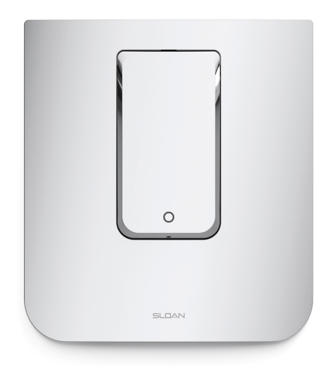
Manual in Polished Chrome (CP)

The new CX wall panel is up to 70% smaller than the industry standard.