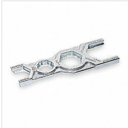
A50 “Super Wrench”

Q: Is it possible for us to purchase the A50 “Super Wrench” and the A109 “Plier Wrench” from Sloan?